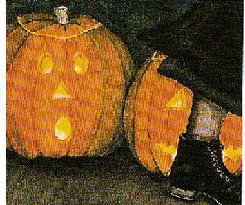
Caption ( what's happening in this picture? )